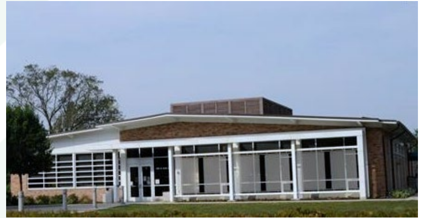
Carol Stream Center